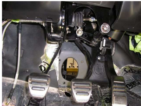
RRS 1967 LHD Mustang booster assy. installed and ready to be plumbed.

6 RRS modular design under-dash pedal assy. is the most compact design available in the market as a ready to bolt in component Note: removable air vent outlet may require modification for clearance